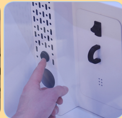
Interior Auto-Purge Button

For more information on the SHEL LAB BacBASIC: Call: (503) 640-3000 Go To: www.shellab.com