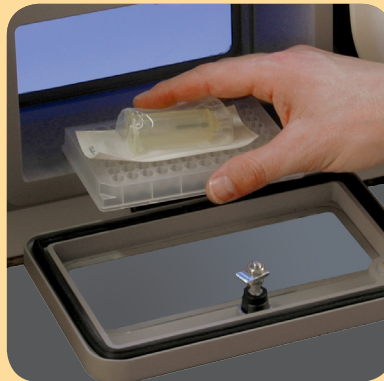
Central Pass Through Box