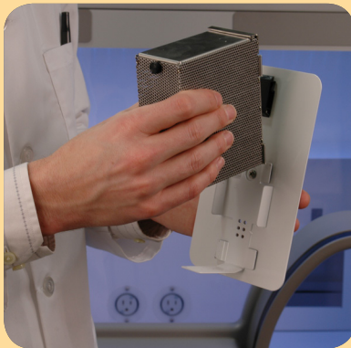
Easy Change Anatox & Catalyst Packs