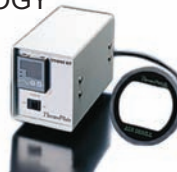
IMAGE & EMISSION SPLITTERS

20/20 TECHNOLOGY LINKAM INSTEC TOKAI HIT